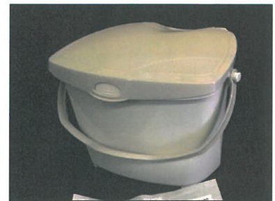
Sure Close Kitchen Composter

We are also selling two types of bins for the kitchen for $10.00. The Busch Kitchen Composter has a filter for eliminating odors and has a capacity of 1.3 gallons. The Sure Close Kitchen Composter has a capacity of 1.9 gallons. Both can be used to store food scraps in the kitchen until you can take them to your composter.