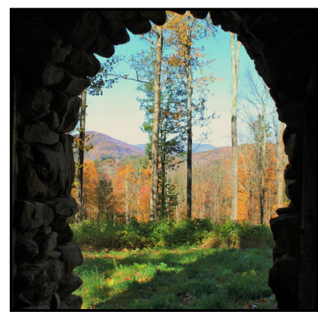
View from inside the tower.