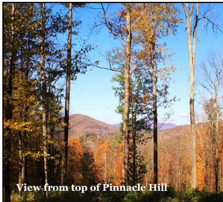
View from top of Pinnacle Hill