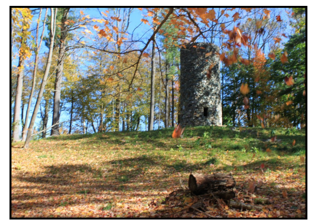
A magical sight in the midst of the woods.

Do you have any praises, suggestions, questions or comments?