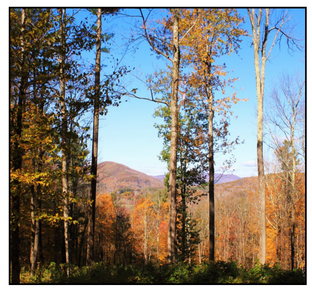
View from Pinnacle Tower