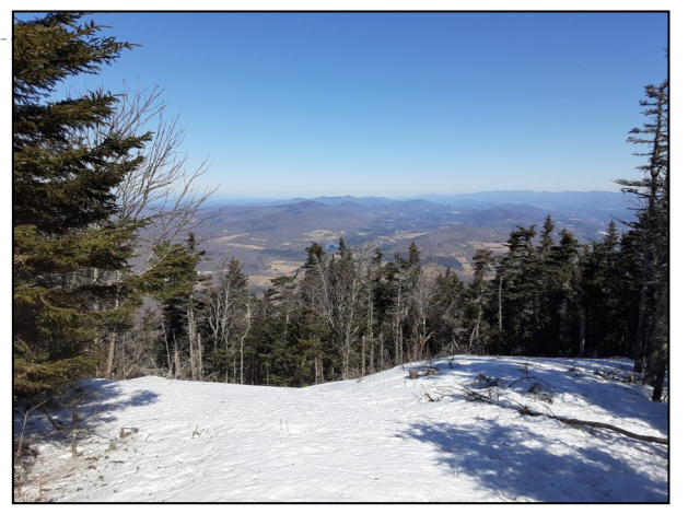
View from Dorset Peak fire tower